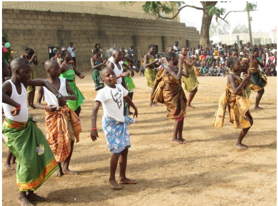
Expression of joy by internally displaced children supported by World Renew.

World Renew provided food and other relief materials in their camp in Jos in December 2015.