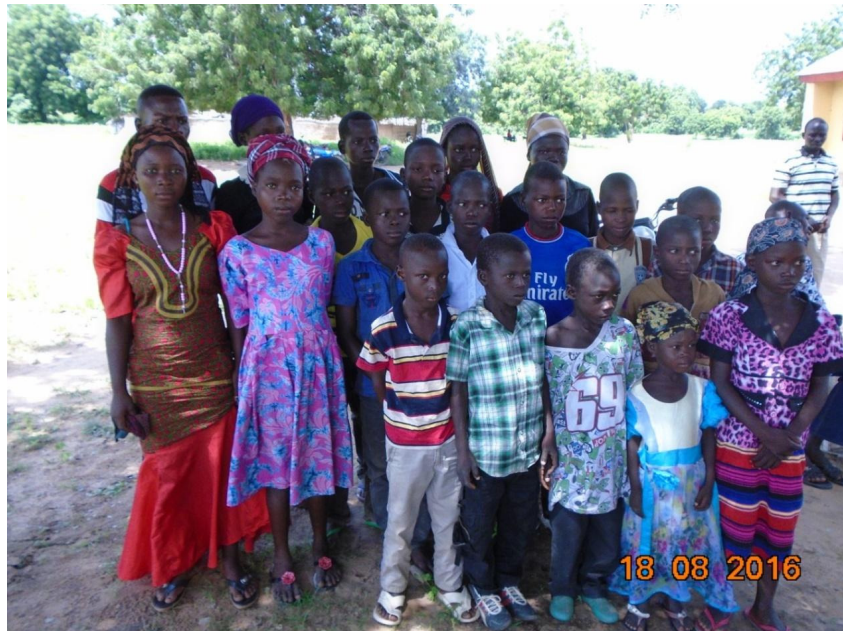
Beneficiary orphans from Gyekan, Adamawa State