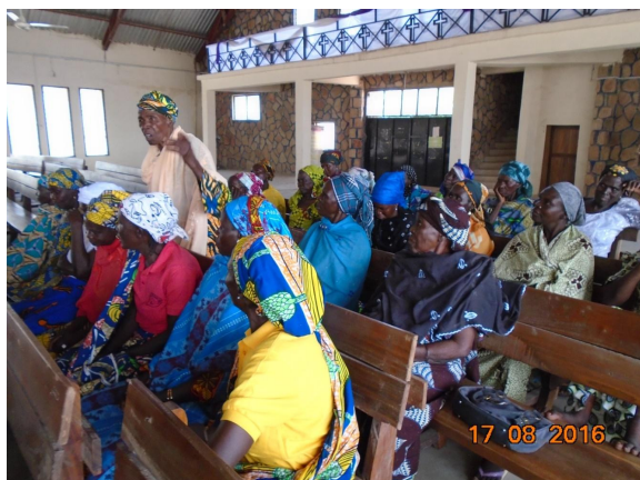
An empowerment session with traumatized widows in Guyuk, Adamawa State