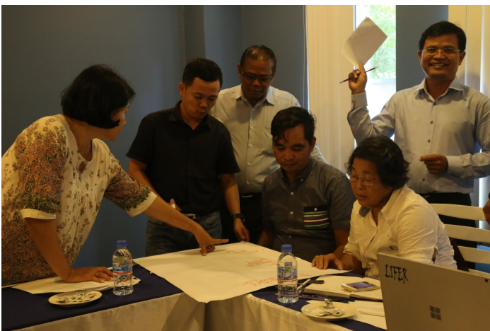
Meeting with CLCDA Resonate Global Mission staff, World Renew senior staff, and the steering committee of a learning network of churches supported by World Renew since 2002 meet to plan a joint program to strengthen these churches to be salt and light in their communities.