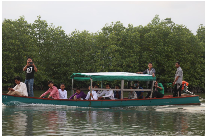
The Discovery Tour includes a visit to a village that has organized to protect its mangrove trees and fishing livelihood. Visitors explore the area by boat.