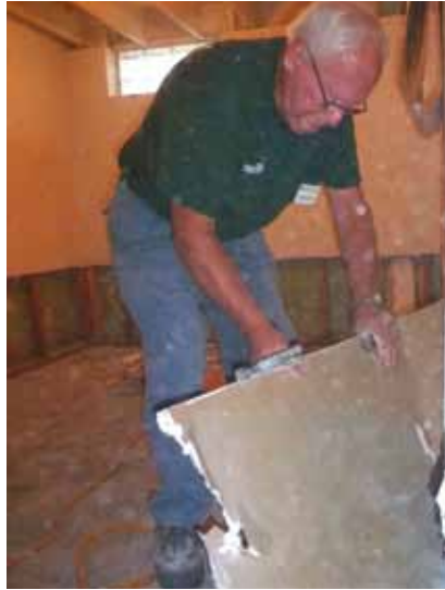
A volunteer tears out drywall in a flooded home.