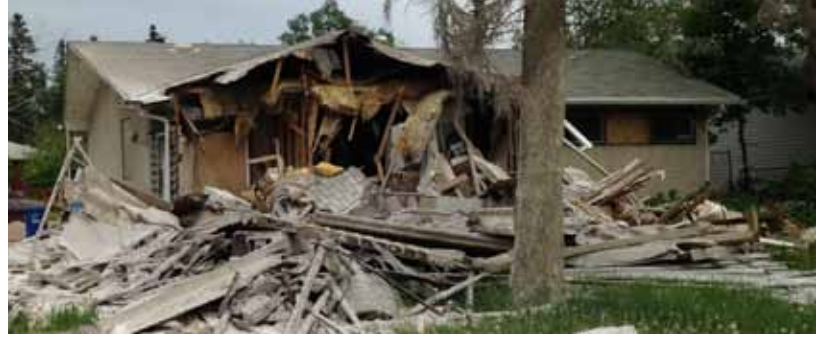
A home that was destroyed by a wildfire in May 2016.

“Another couple who came to the World Renew walk-in center was struggling to start their life over after the fire