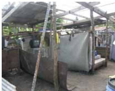
Saipan residents make do with what is left of their belongings.

We requested immediate help, and the family received assistance to address their emergency needs.