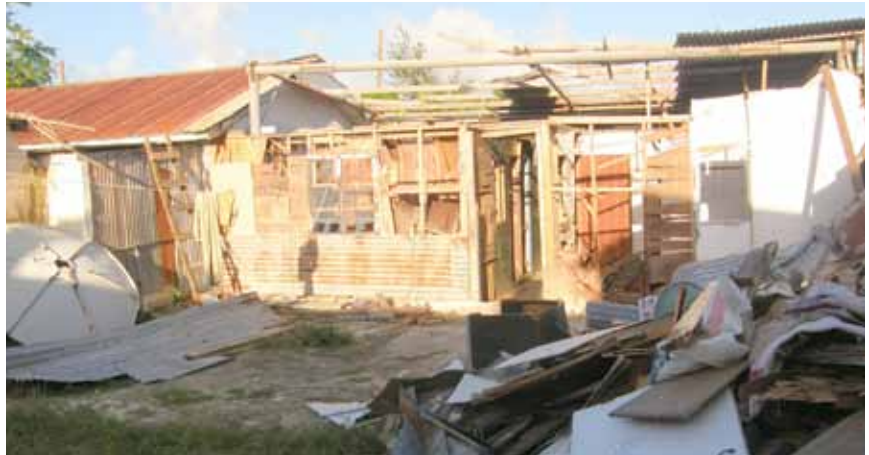
The typhoon left many homes in ruin.

“Another family of seven was living in four rooms of their damaged home, and their situation was dire. When we visited, we found a mother and daughter, both elderly, sitting on a bed in one of the rooms. One woman was an amputee and both women were blind. The family was caring for them the best they could. Their lives were further complicated by the lack of a functioning bathroom. It had no roof and was continually flooded by broken pipes.