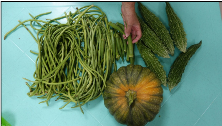
Some of the bounty shared with us from the Bulod community garden.