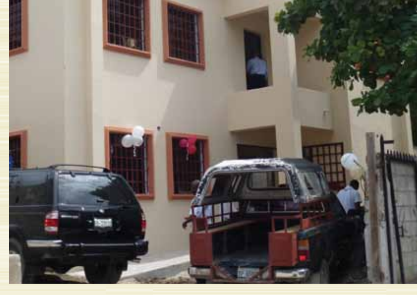
World Renew assisted its long-time partner, PWOFOD, in rebuilding their office space

During 2012, World Renew partnered with the local Mayor's office to provide a temporary rental subsidy