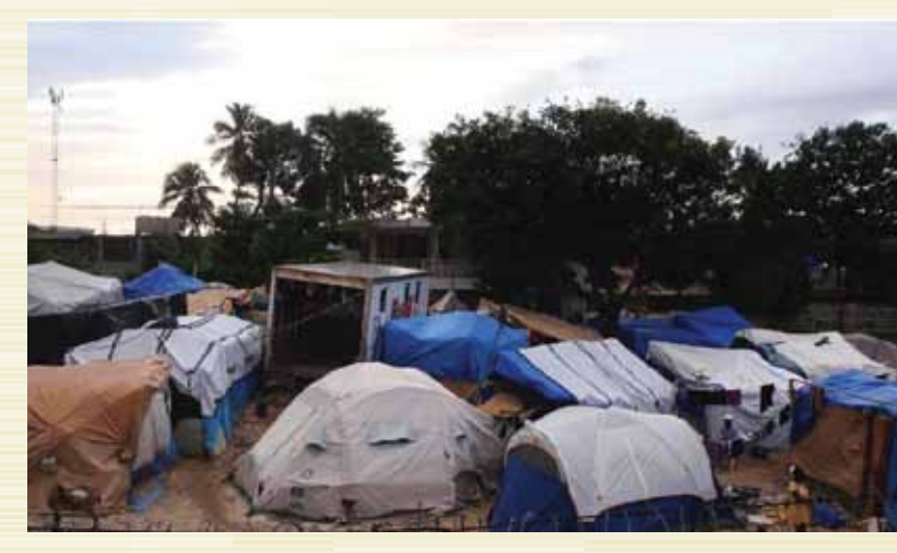
Make-shift tent settlement in Port-au-Prince