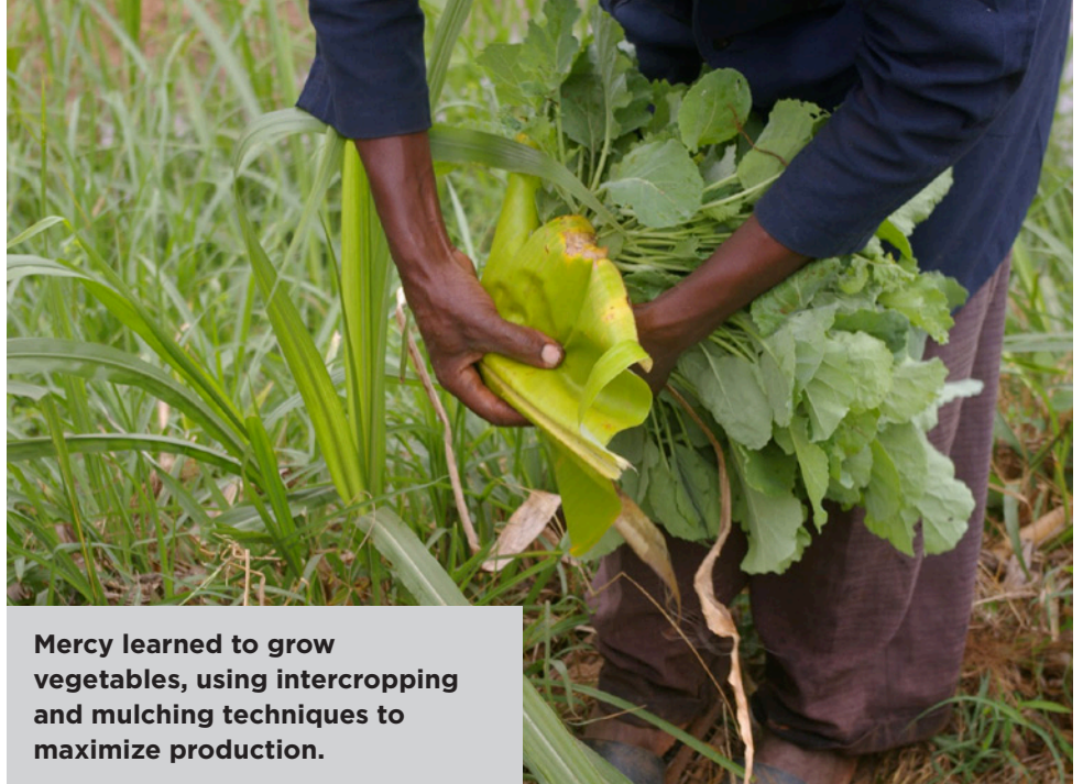
Mercy learned to grow vegetables, using intercropping and mulching techniques to maximize production.