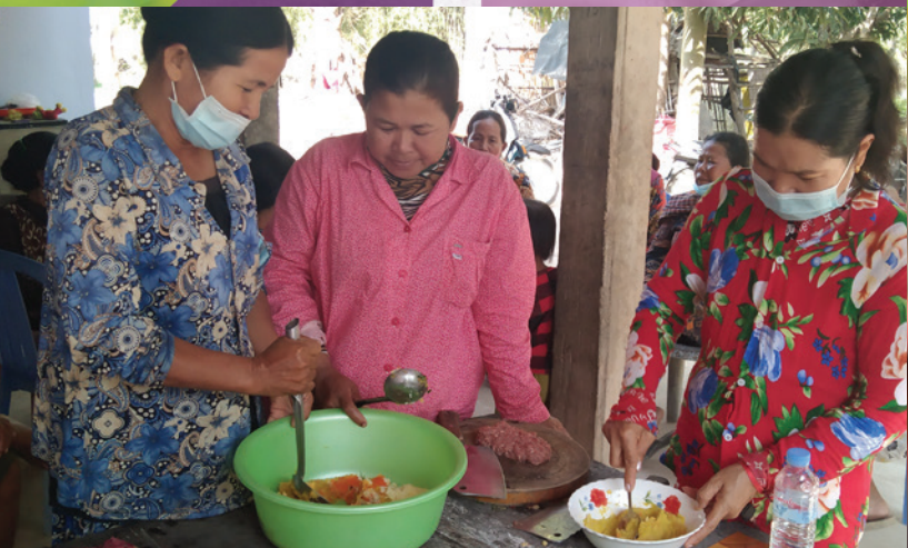
kitchen hygiene training