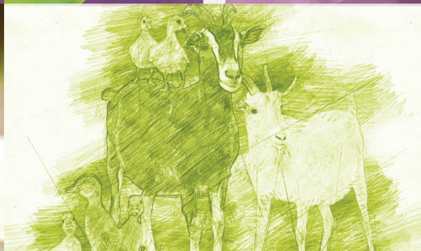
goats & quackers