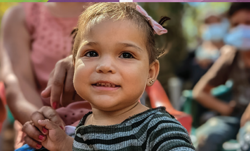
nutrition kit for children