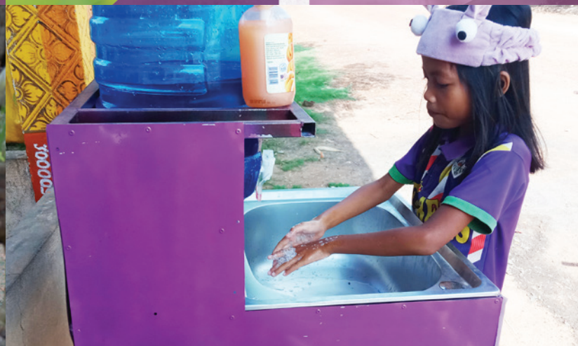
handwashing kit for children